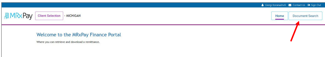
Figure 1.0.1 – MRx Pay Finance Portal Home window

The WebRA tool has been upgraded and is now known as MRxPay. MRxPay provides the same ability as the previous tool to search for and view remittance advices (RAs). If you are an existing WebRA user, you will need to complete the UAC Migration steps prior to accessing MRxPay (a link to the UAC Migration Job Aid can be found on the Provider Home window).