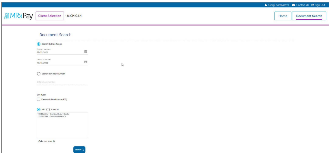
Figure 1.0.2 – Document Search window